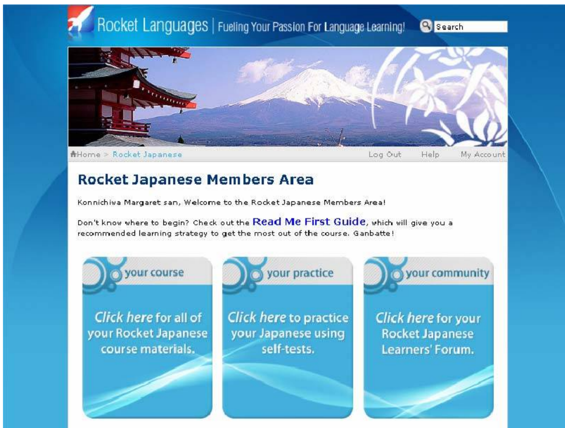
Screen shot of the Rocket Japanese course Welcome page.

All of the tools and materials available in the course package are integrated online into a single Learning Management System developed by and customized for Rocket Languages.