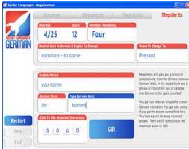
Screen shot of Rocket German verb learning game.

The verb practice game differs from the other two in that it involves writing in the target language. Users are given a verb from a database of 50 of the most common verbs in the target language, and also a tense to change the verb into. They type the conjugated verb into the answer field.