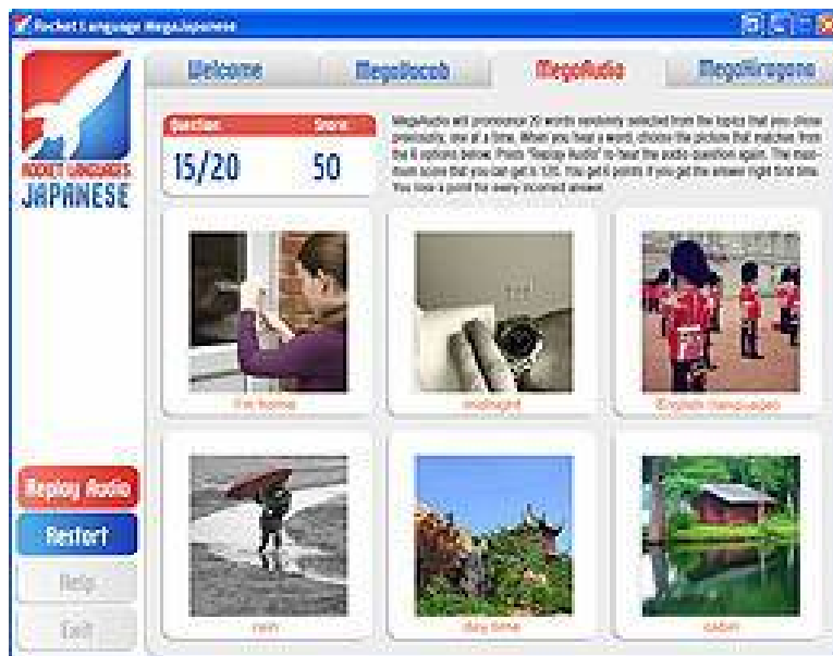
Screen shot of the Rocket Japanese audio comprehension learning game.

In the audio comprehension game, users play an audio clip of a word or phrase in the target language and select the corresponding word or phrase from six options displaying image and a translation.