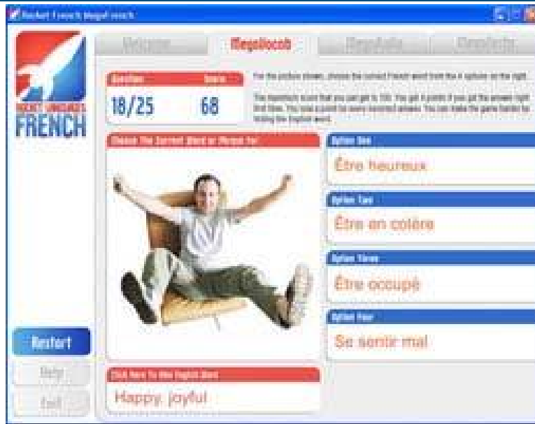
Screen shot of the Rocket French vocabulary learning game.

In the audio comprehension game, users play an audio clip of a word or phrase in the target language and select the corresponding word or phrase from six options displaying image and a translation.