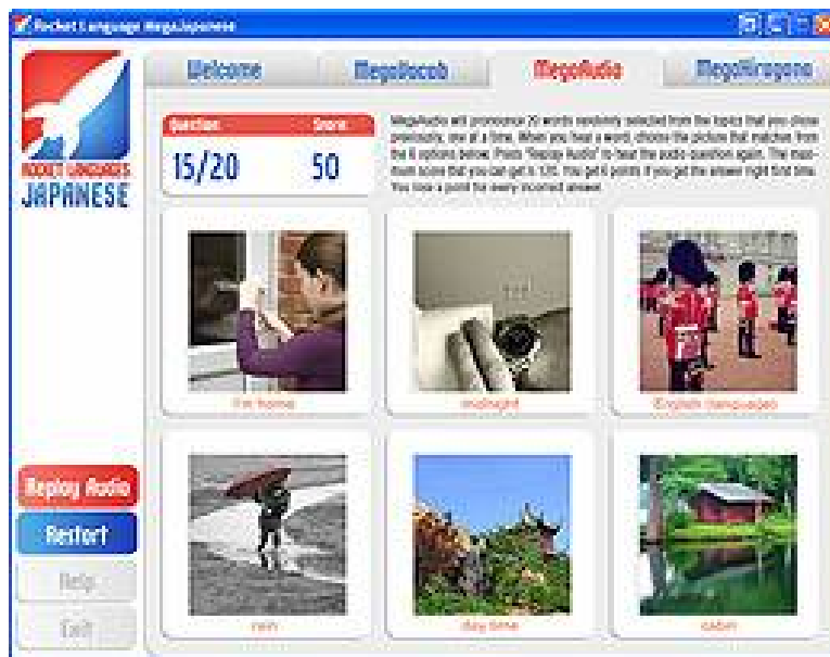
Screen shot of the Rocket Japanese audio comprehension learning game.

In the audio comprehension game, users play an audio clip of a word or phrase in the target language and select the corresponding word or phrase from six options displaying image and a translation.