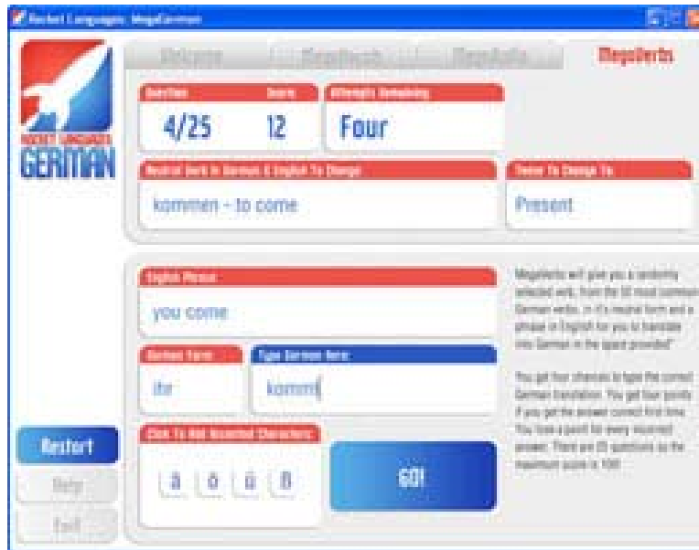
Screen shot of Rocket German verb learning game.

The verb practice game differs from the other two in that it involves writing in the target language. Users are given a verb from a database of 50 of the most common verbs in the target language, and also a tense to change the verb into. They type the conjugated verb into the answer field.