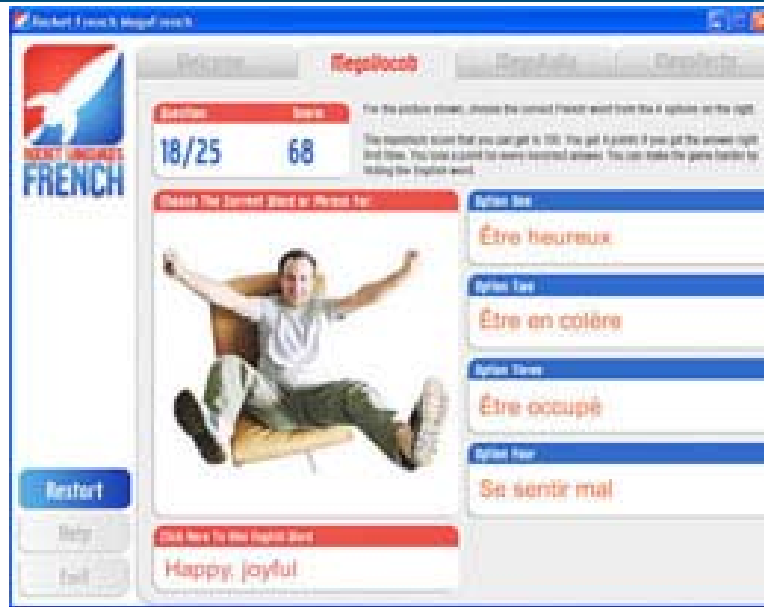
Screen shot of the Rocket French vocabulary learning game.

In the audio comprehension game, users play an audio clip of a word or phrase in the target language and select the corresponding word or phrase from six options displaying image and a translation.