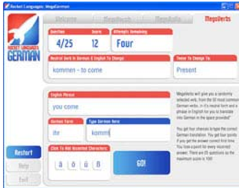
Screen shot of Rocket German verb learning game.

The verb practice game differs from the other two in that it involves writing in the target language. Users are given a verb from a database of 50 of the most common verbs in the target language, and also a tense to change the verb into. They type the conjugated verb into the answer field.